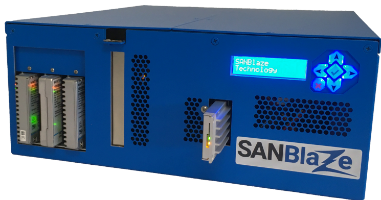
SANBlaze SBExpress-DT4 NVMe SSD Test System